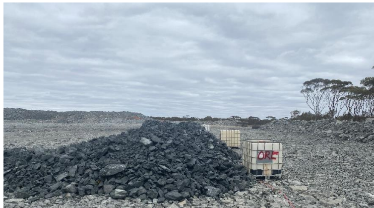
Figure 2: First ore, Cassini ROM pad

Cassini is one of two key production sources for Mincor's Kambalda Nickel Operations, with first ore from the Northern Operations being transported to the Kambalda Nickel Concentrator in February (see ASX announcement, 15 February 2022).